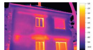
Thermal image with ScaleAssist