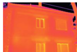
Thermal image without ScaleAssist

Since the temperature scale and coloring of thermal images can be adapted individually, it is possible that the thermal behavior of a building, for example, can be wrongly interpreted. The testo ScaleAssist function solves this problem by adjusting the color distribution of the scale to the interior and exterior temperature of the measurement object and the difference between them. This ensures objectively comparable and error-free thermal images.